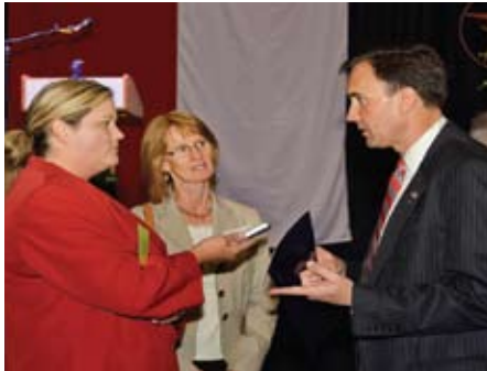
LEFT: U.S. Rep. Pete Olson talks to reporters after speech during breakfast.