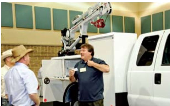
Exhibitors at the Alliance Expo included Casco Truck Body (left) and Terracon (below). The expo has sold out 8 years in a row.