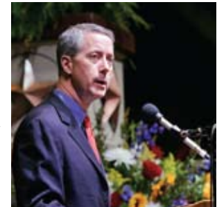
RIGHT: U.S. Rep. Mac Thornberry spoke at The Membership Luncheon on April 27.